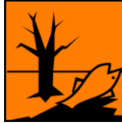
Dangerous for the environment